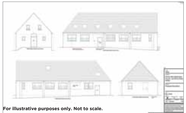
For illustrative purposes only. Not to scale.