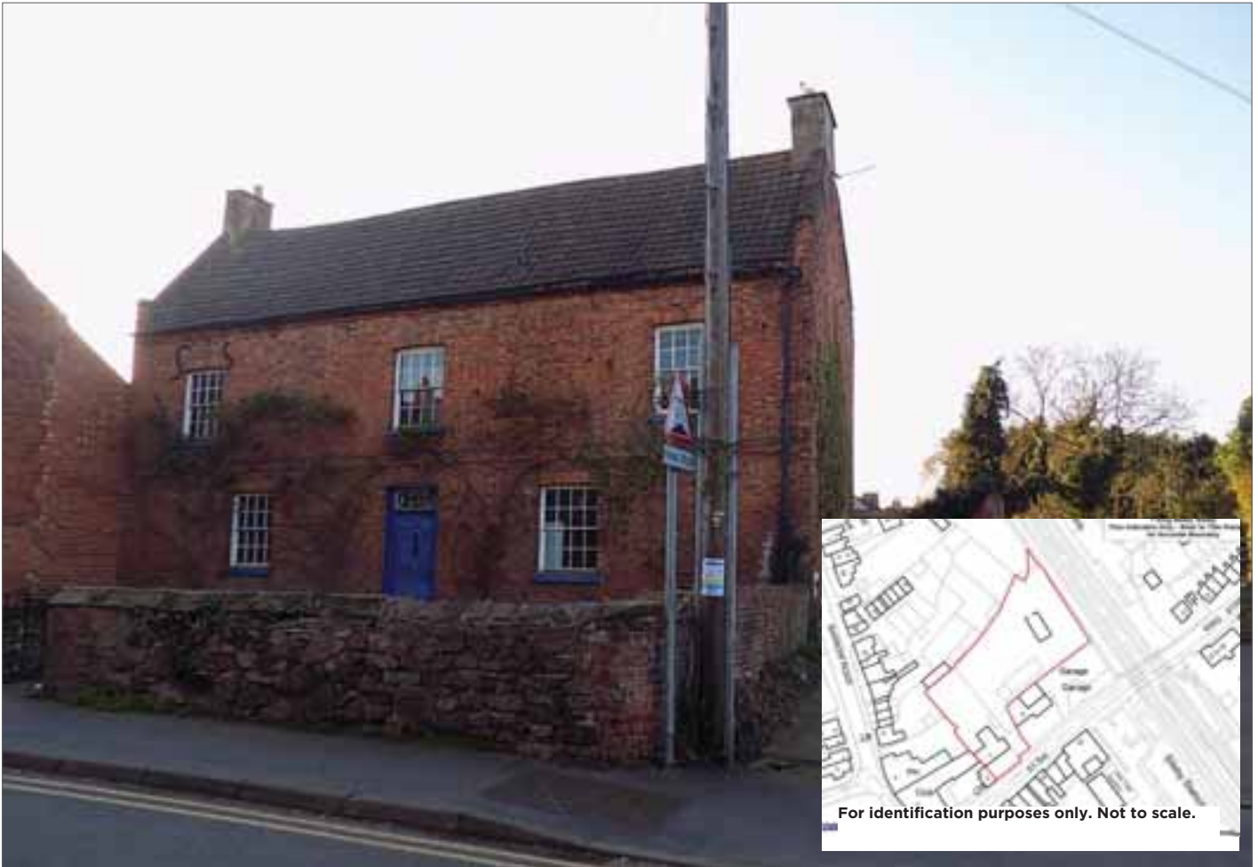
For identification purposes only. Not to scale.